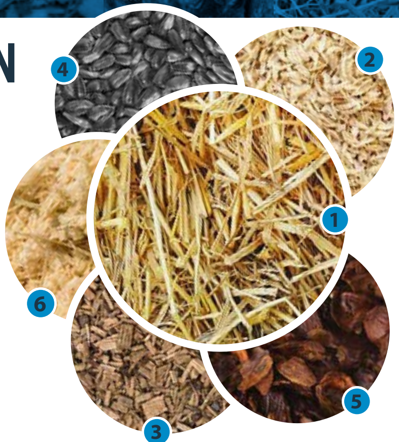
1. Straw 2. Rice Paddy 3. Wood Chips 4. Sunflower Peel 5. Coffee Husk 6. Bagasse

We carry out our productions meticulously in line with the needs of our customers with sustainable, innovative and environment friendly technologies towards Biomass industry